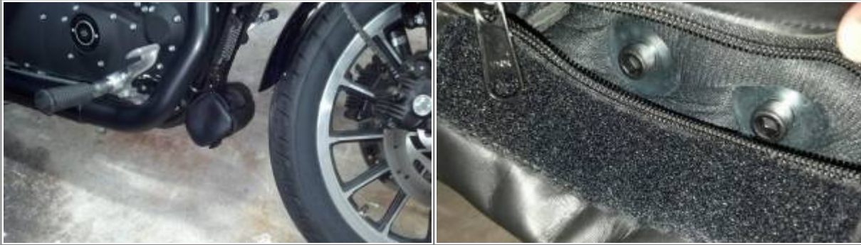
HD downtube bag. 4)

It's waterproof and small enough to mount on the downtubes.