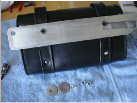
If after the bag gets broken in and it sort of flops over, you can add some metal flat stock inside the bag to keep it rigid. 19)