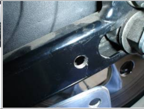
Inside the bag, large flat washers, lock washers and nylocks. 17)