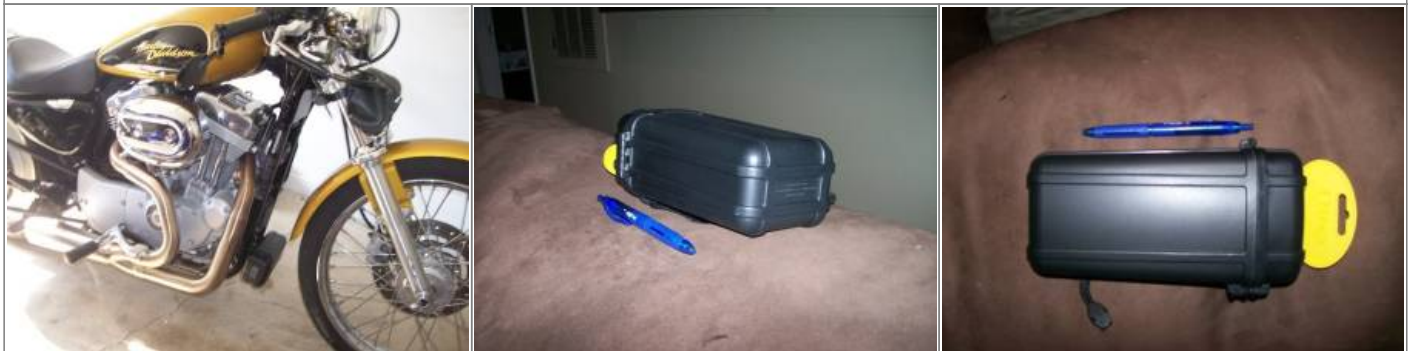
9000 series Otter Box fastened to the downtubes. 6)