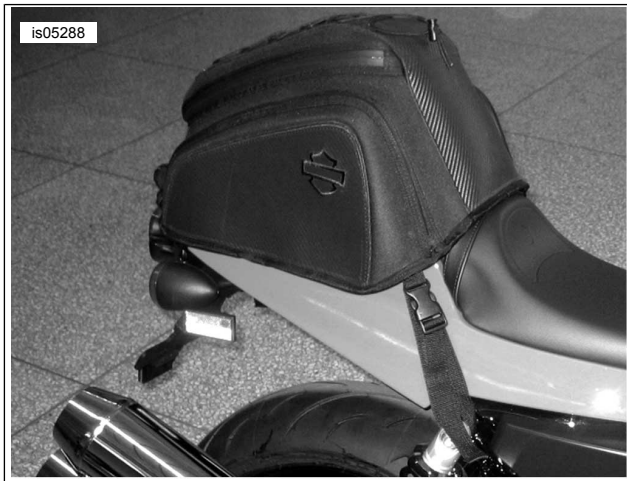
Figure 1. Mounted Tail Bag