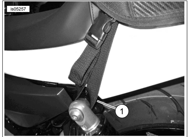
Figure 2. Front Strap Attached to Shock Mount