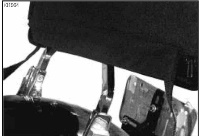
Figure 2. Place Brief Sac over Sissy bar (straps will hang down)