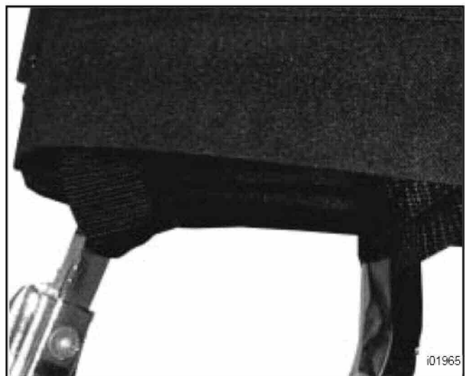
Figure 2. Fasten straps around sissy bar and into the female clips located on the side of the sissy bar cover