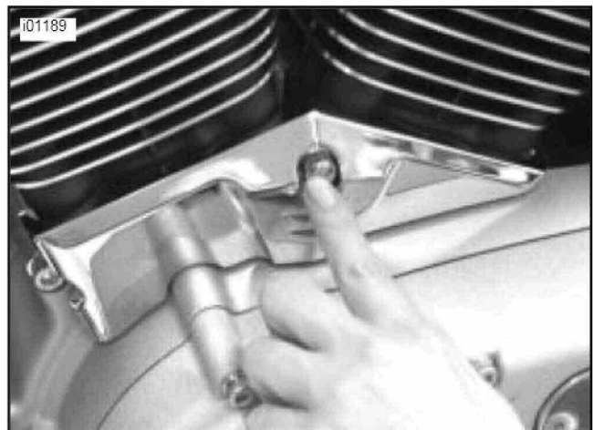
Figure 3. Press chrome "hot spot" into bolt end