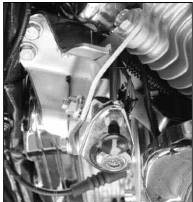
Figure 2. Mounted Horn