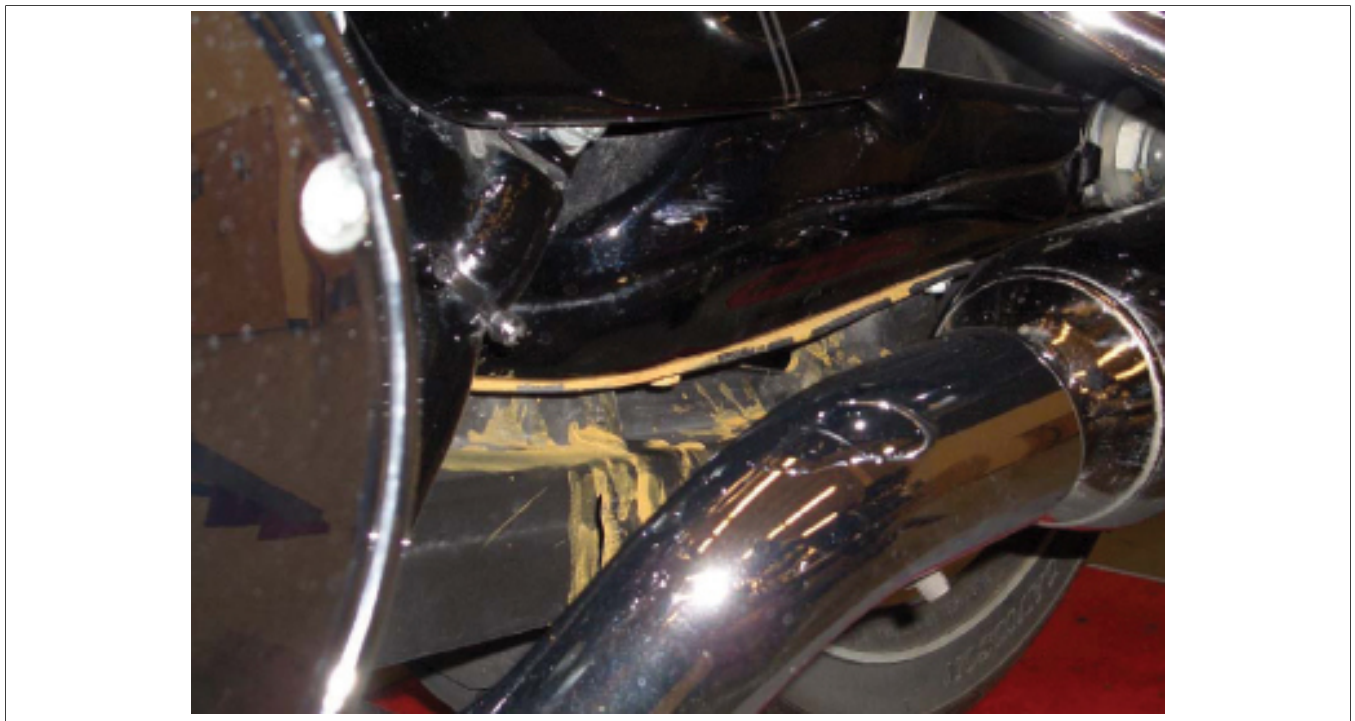
Figure 1. Swingarm

This is a cosmetic concern and not an indication of an internal issue.