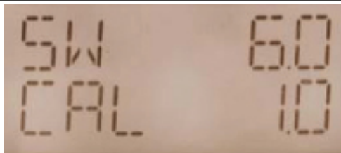
Figure 2. A Software Level of 6.0