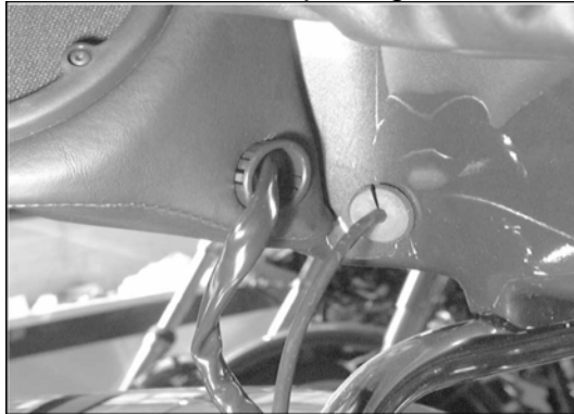
Plastic grommet (shown partially installed)