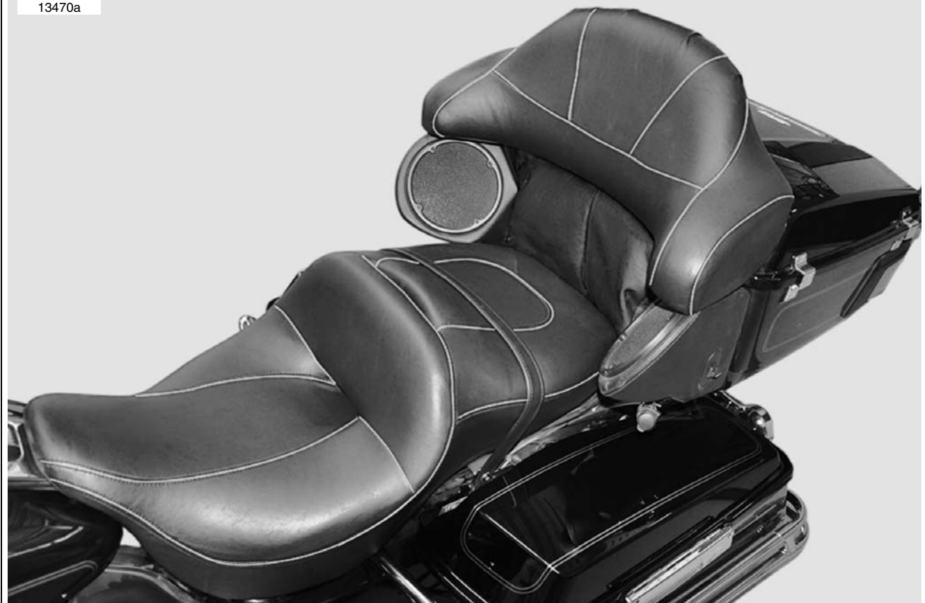
Figure 2. Original 2009/2010 Seat and Backrest