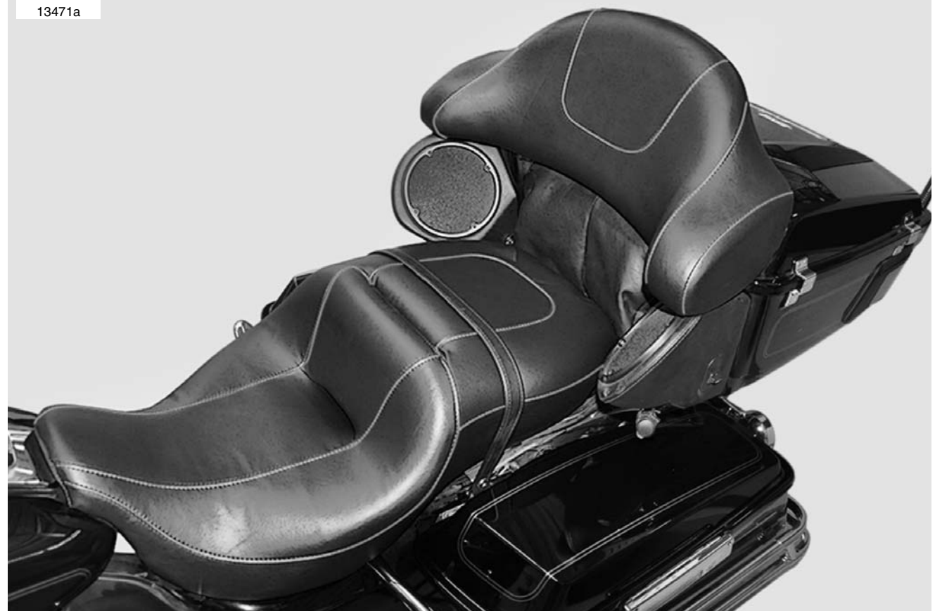
Figure 3. New Low 2010 Seat and Backrest