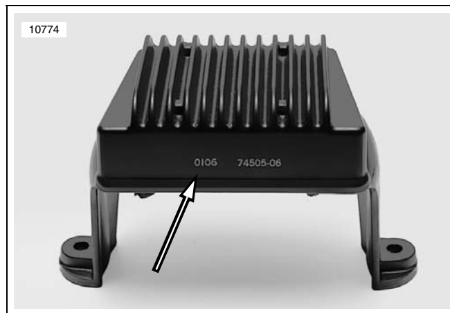
Figure 1. Stock (Black) Voltage Regulator Date Code

If the vehicle is not on your dealership VIN list, check the Safety and Product Campaign History by VIN link.