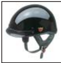
Classic Cruiser-Gloss Black Part number 98060-00V