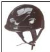
Midnight Flame: Medallion Part number 97226-02VX