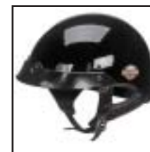
Spoiler-Gloss Black Part number 97352-01V