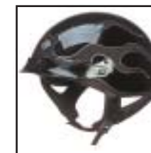
Defiance Part number 97343-01V