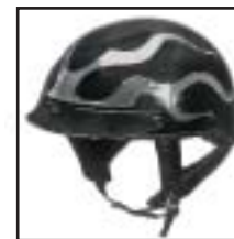
Phantom Flame Part number 97208-02V Manufactured between 2001/08/01 and 2001/08/31

If you own one of the following helmets: