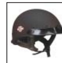
Spoiler-Flat Black Part number 97353-01V