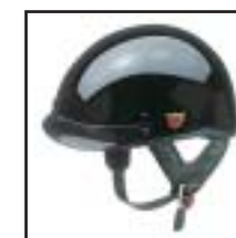
Classic Cruiser-Gloss Black Part number 98060-00V