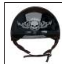
Blade Part number 97231-01V Manufactured between 2000/05/01 and 2000/11/30