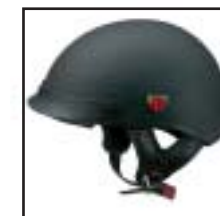
Classic Cruiser-Flat Black Part number 98061-00V Manufactured between 1999/11/01 and 2000/11/30

*You can choose from one of the comparable helmets below: