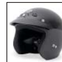
Road Classic-Gloss Black Part number 98816-03V