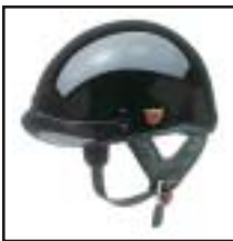
Classic Cruiser-Gloss Black Part number 98060-00V Manufactured between 1999/11/01 and 2000/11/30