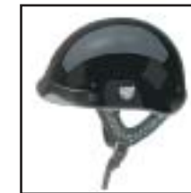
Trespasser Part number 97157-01V

*You can choose from one of the comparable helmets below: