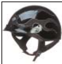
Defiance Part number 97343-01V Manufactured between 2000/12/01 and 2001/01/31