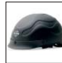
Titanium Flame Part number 97224-03V Manufactured between 2002/05/01 and 2002/05/31