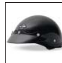
Torque Part number 98813-03V