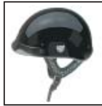
Trespasser Part number 97157-01V