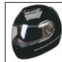
Superglide® Part number 97350-01V

* If comparable helmet is not acceptable, the suggested retail price of the helmet will be refunded.