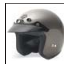
Road Classic-Titanium Part number 98815-03V