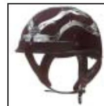
Midnight Flame: Decal Part number 97227-02VX Manufactured between 2001/07/01 and 2002/02/28