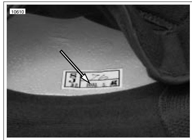
Figure 1. Date of Manufacture