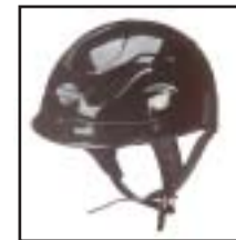
Midnight Flame: Medallion Part number 97226-02VX