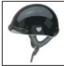
Trespasser Part number 97157-01V Manufactured between 2000/04/01 and 2000/12/31