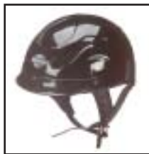
Midnight Flame: Medallion (previously called Black Flame) Part number 97226-02VX Manufactured between 2001/07/01 and 2002/02/28