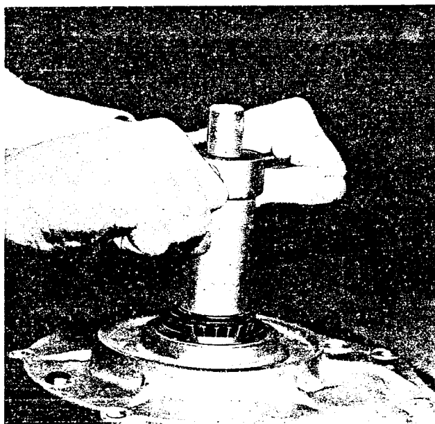
Figure 3. Assembling Flywheels into Sprocket Side Crankcase

When bearing seems free, assemble crankcases complete with pinion bearing and check endplay with dial indicator on gearshaft using the installing tool tightened to approximately 60 ft.-lbs. Rotate flywheels and read dial indicator at extreme ends of crankshaft endplay to determine endplay and correct endplay if necessary.