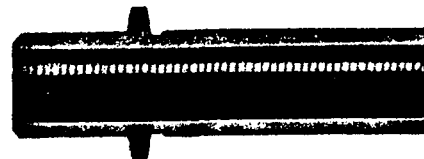
Steel Exhaust Valve Guide

18188-48A (Standard) 18189-48A (.001" oversize) 18190-48A (.002" oversize) 18191-48A (.003" oversize) 18192-48A (.004" oversize) 18193-48A (.006" oversize)