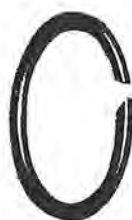
Part No. 35337-56 Retaining Ring