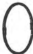
Part No. 35364-56 Washer