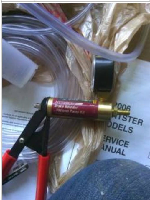
Pittsburg Brake Bleeder Vacuum Pump 4)