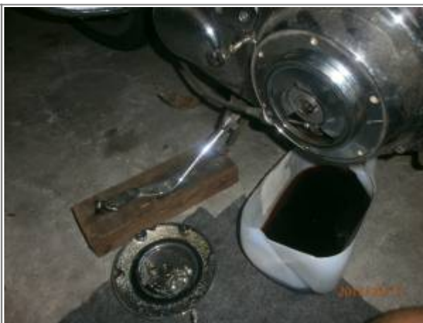
Cut up milk jug catch pan 24)

This type container allows you to either store or transport used oil without as much problems with spillage.