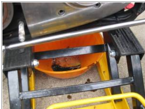
Oil Catch Pan 23)