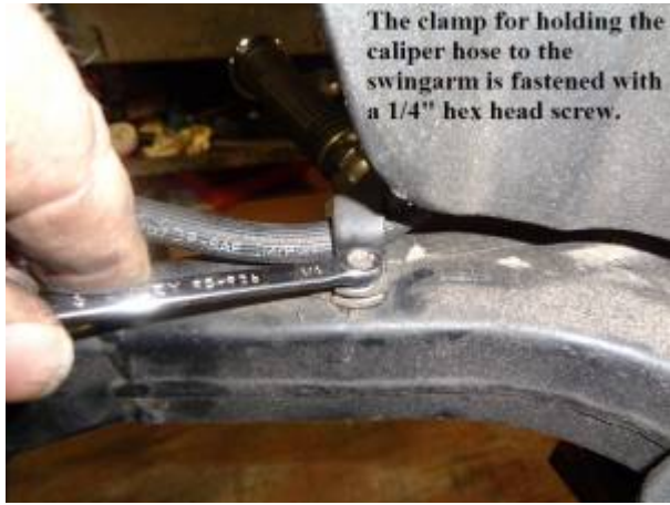
The clamp for holding the caliper hose to the swingarm is fastened with a 1/4" hex head screw.