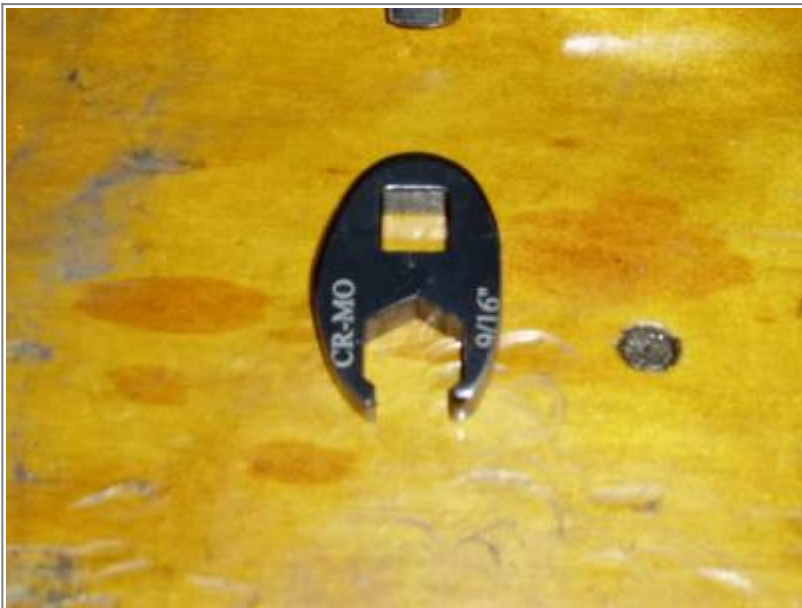
Crows foot for the 9/16" base nut. If you grind down a crows foot like this, it works quite well, 1)