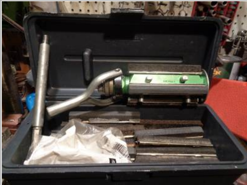
Lisle 15000 Cylinder Hone 3)