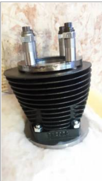
Torque plates installed. 4)

There are multiple hole patterns for use on other model HDs also.