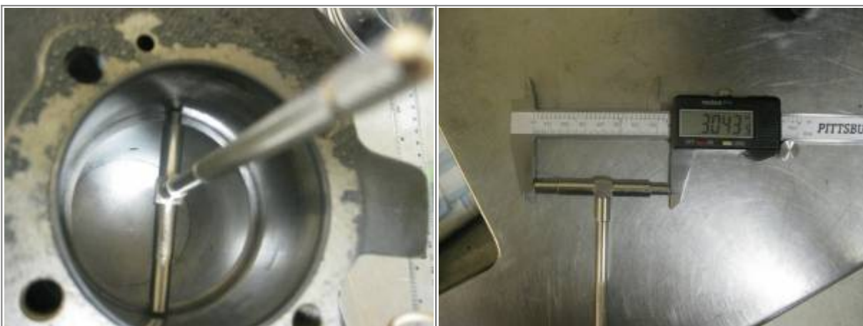
Telescoping bore gauge and caliper for measuring cylinder I/D. 2)