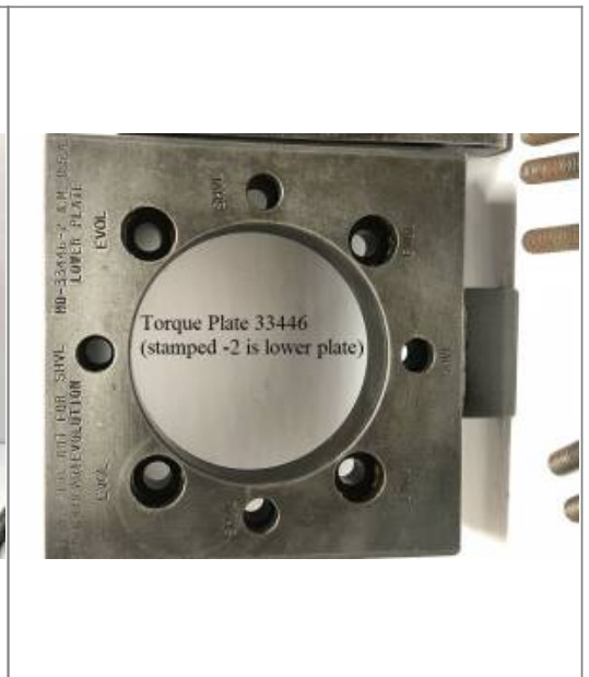
Torque Plate 33446 (stamped -2 is lower plate)