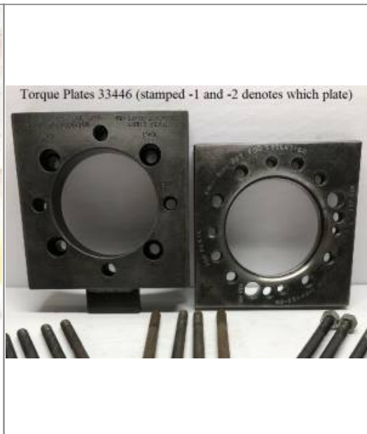
Torque Plates 33446 (stamped -1 and -2 denotes which plate)