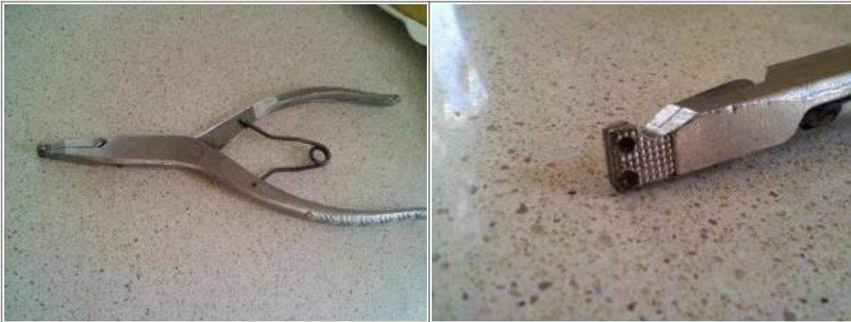
Retaining ring pliers 8)