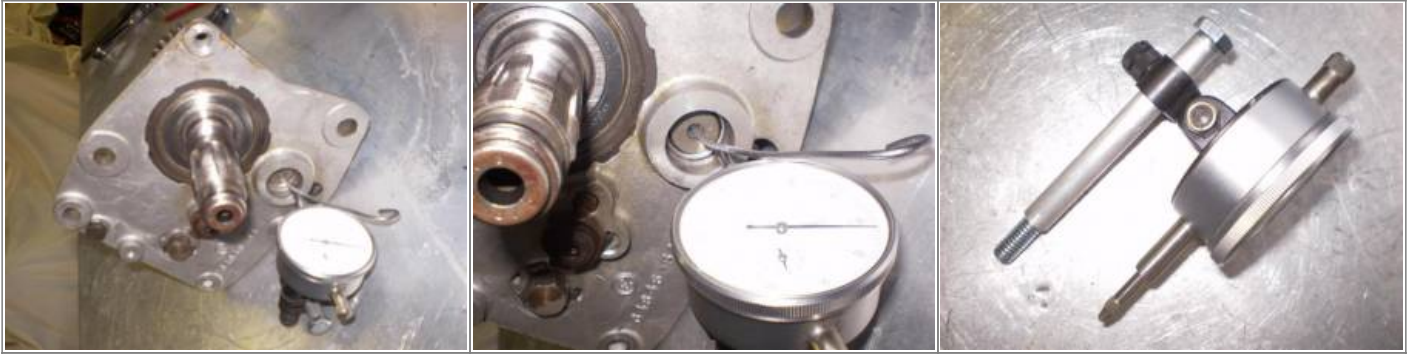
Dial Indicator for checking Countershaft Endplay 2)