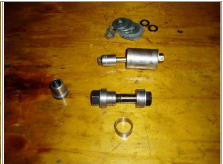
A pair of sockets and a 3/8" bolt for extraction, a stepped collar on a 9/16 bolt to install. 5)