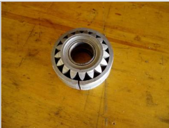
Countershaft low gear bushing jig for use in a 3 jaw chuck lathe 4)