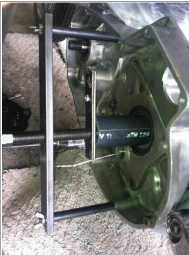
Mainshaft Bearing Press 1)