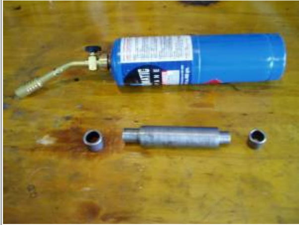
Drift for the transmission countershaft needle roller bearings 7)