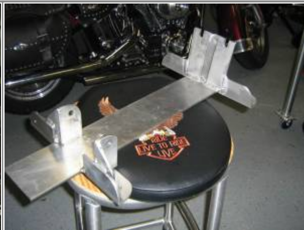
Iron Head (72) Engine Stand 2)