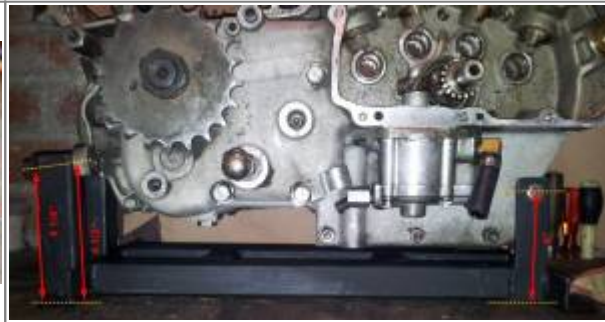
Iron Head Engine Stand 1)