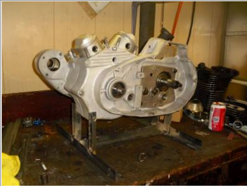
Homemade Engine Stand Welded from Bed Angle 4)