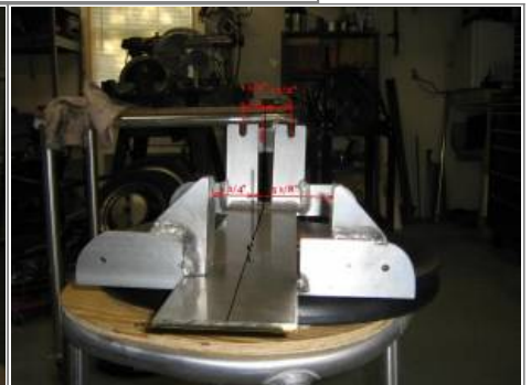
Iron Head (72) Engine Stand 3)