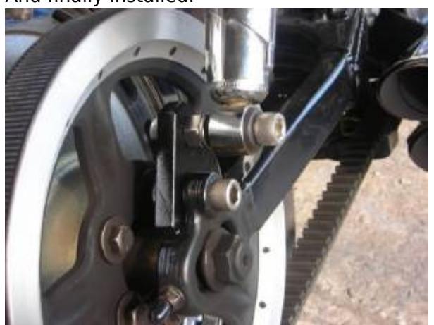
And finally installed.