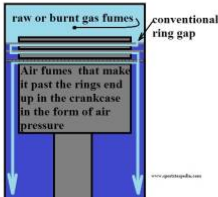
Healthy engine with normal blowby