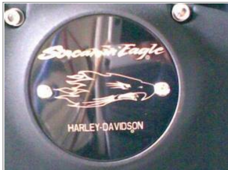
Timing cover by jrogers329 19)