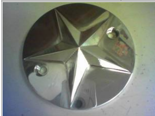
Timing cover by biknut 22)