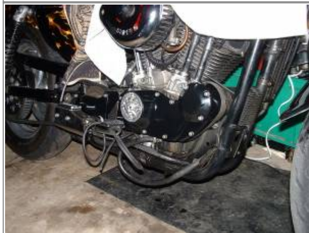
Timing cover by rottenralph 23)