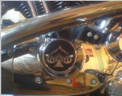
As sold to flourman 16)