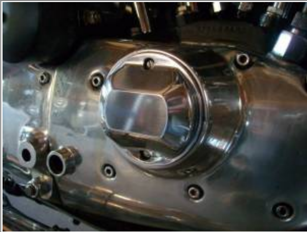
Timing cover made by drumballer 15)