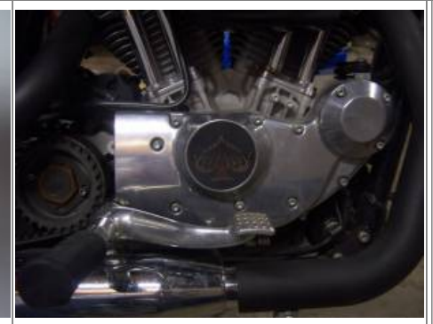
Brass ignition cover. 17) 18)