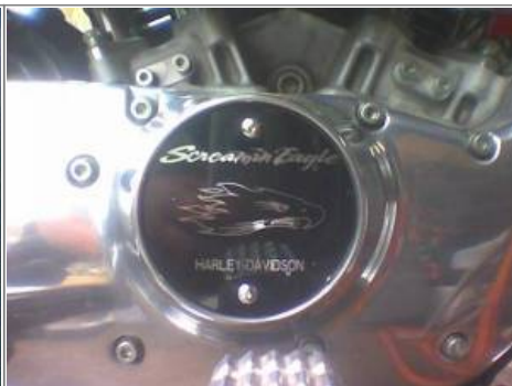
Timing cover by biknut 20)