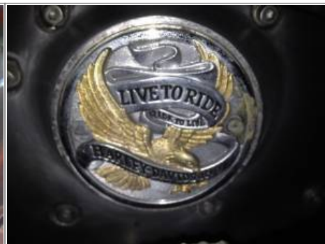
Timing cover by Rollbar 21)