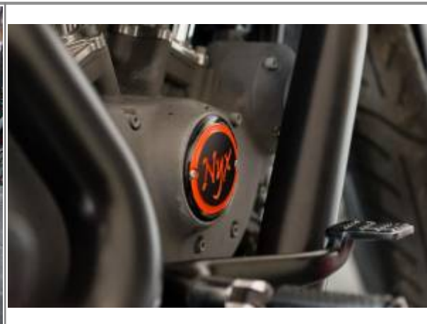
Timing cover by sportytrace 24)