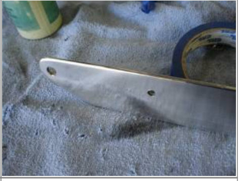
The bag mounting holes in the bracket were partially counter bored to allow clearance between