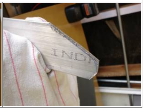
Edges rounded with a file, bracket wet sanded with 320/400/1500 grit paper respectively and then hand polished. 12)