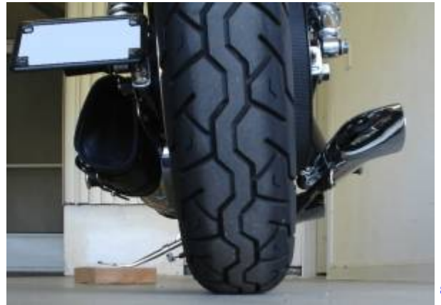
Making a bracket mount for a leather tool bag. Bracket was made from 1/8" thick aluminum and some misc chrome hardware. An angle was cut on the front end. 9)