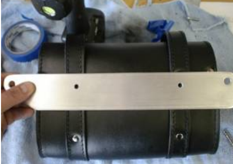
The hole was then drilled and tapped. 14)