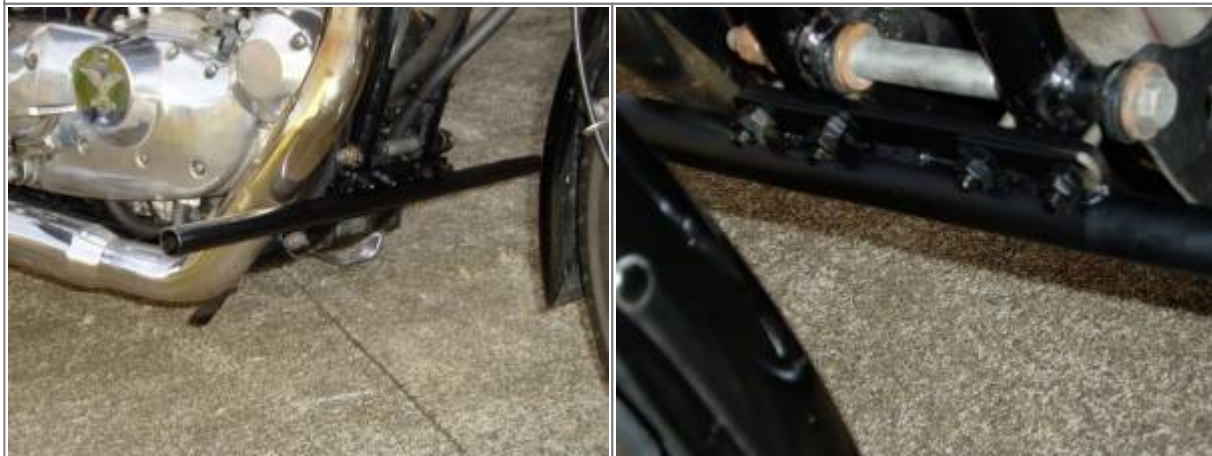
Homemade highway bar. 19)