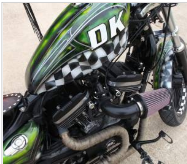
Custom trap style brake pedal. 1)

The brake pedal has to be removed for cutting and shaping.