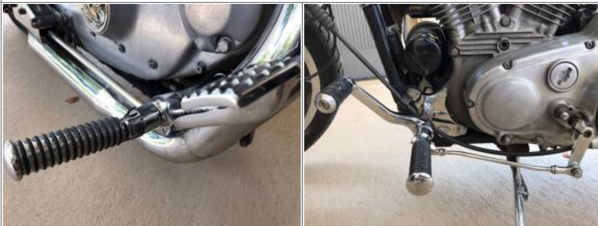
Pegs mount as usual. 5)

The shifter pedal arm slides onto the main support shaft. You can use axle grease and install it if needed. Use blue Loctite to secure the shifter foot peg to the shifter arm and align to your liking.