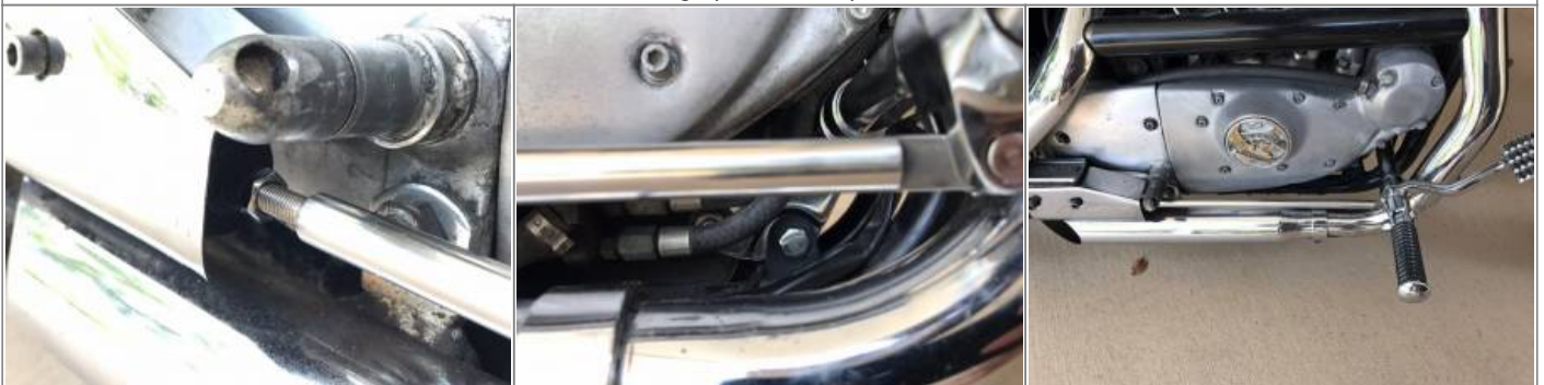
Hooking up the brake pedal. 7)

Note: Make sure to test the brake pedal action over low rpms and readjust the length if needed.