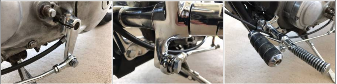
Hooking up the shifter. 6)

The brake pedal arm slides onto the main support shaft. You can use axle grease and install it if needed. To install the brake rod to the master cylinder, Two wrenches are needed to unscrew the old OEM rod and install the new longer one. Screw the rod into the M/C to adjust the length of the rod from the M/C to the brake pedal to your liking. (however, 45 degrees is suggested) Then secure the pedal end of the rod in the brake arm with the provided cotter pin.