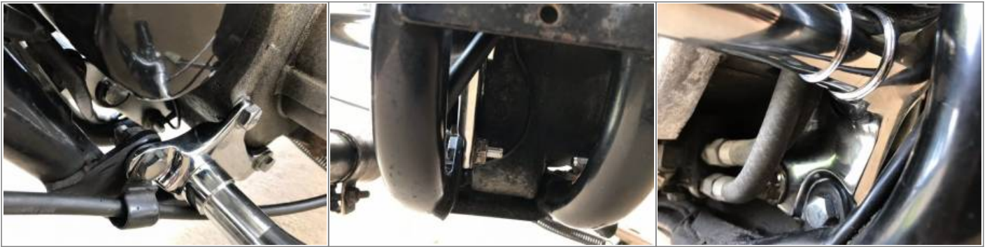
Right side. 4)