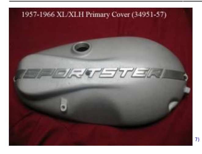
Click on a pic to enlarge: 8)