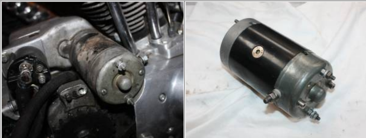
74-E76 Hitachi starter. 2)