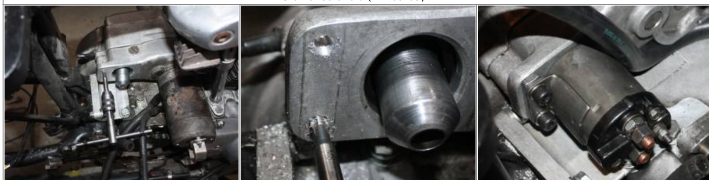
Starter solenoid (71469-65) 5)

Then the mounting bracket and spacer were drilled 8mm and the solenoid was installed using allen head cap screws and spring washers.