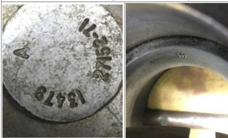
27152-71 (13479E) arbitrary 'E', adjustable jet 28)