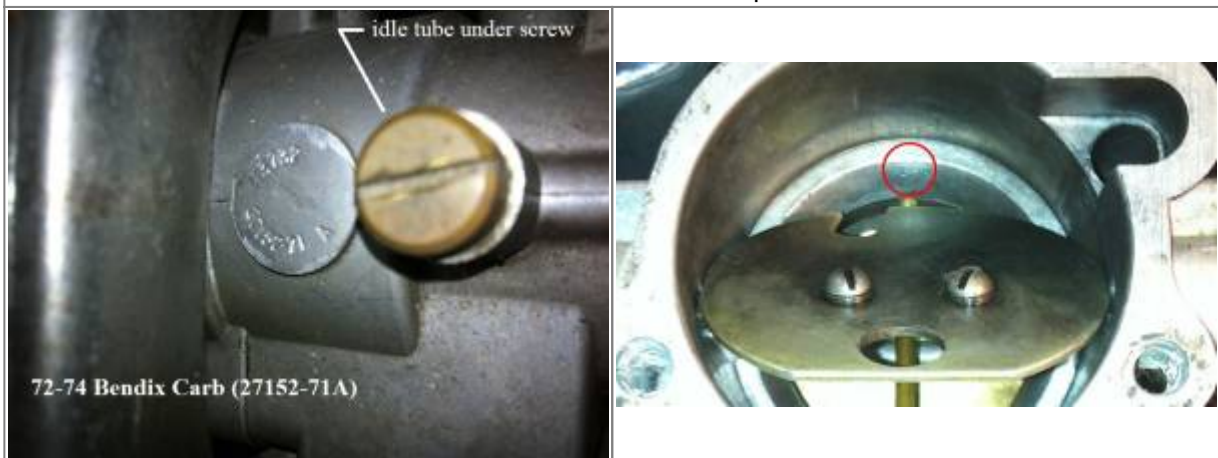
27152-71 (13479A) arbitrary 'A' - venturi stamped '36' 27)