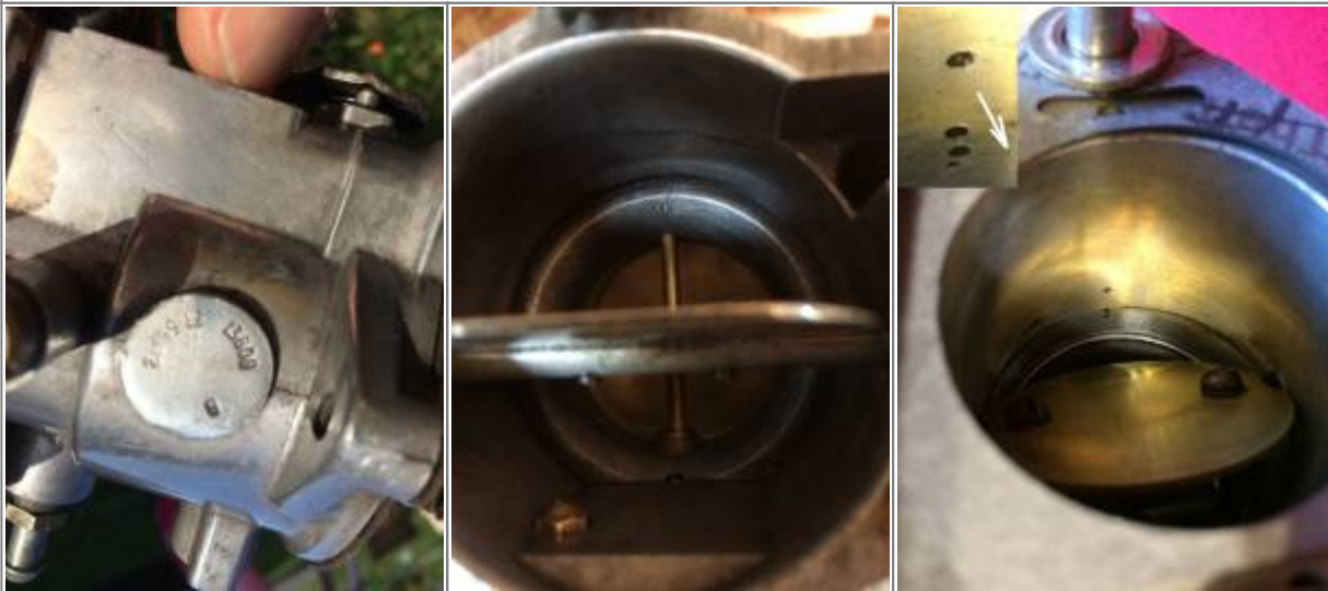
27155-72B (13731C), arbitrary 'C', venturi stamped 38mm 24)